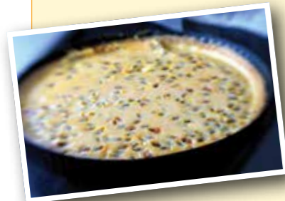
Recipe and photo courtesy Lena Pobjie

Reduce oven to 160°C. Pour egg mixture into the pastry case. Bake for 35 minutes or until set. Place in fridge overnight to chill. Enjoy!