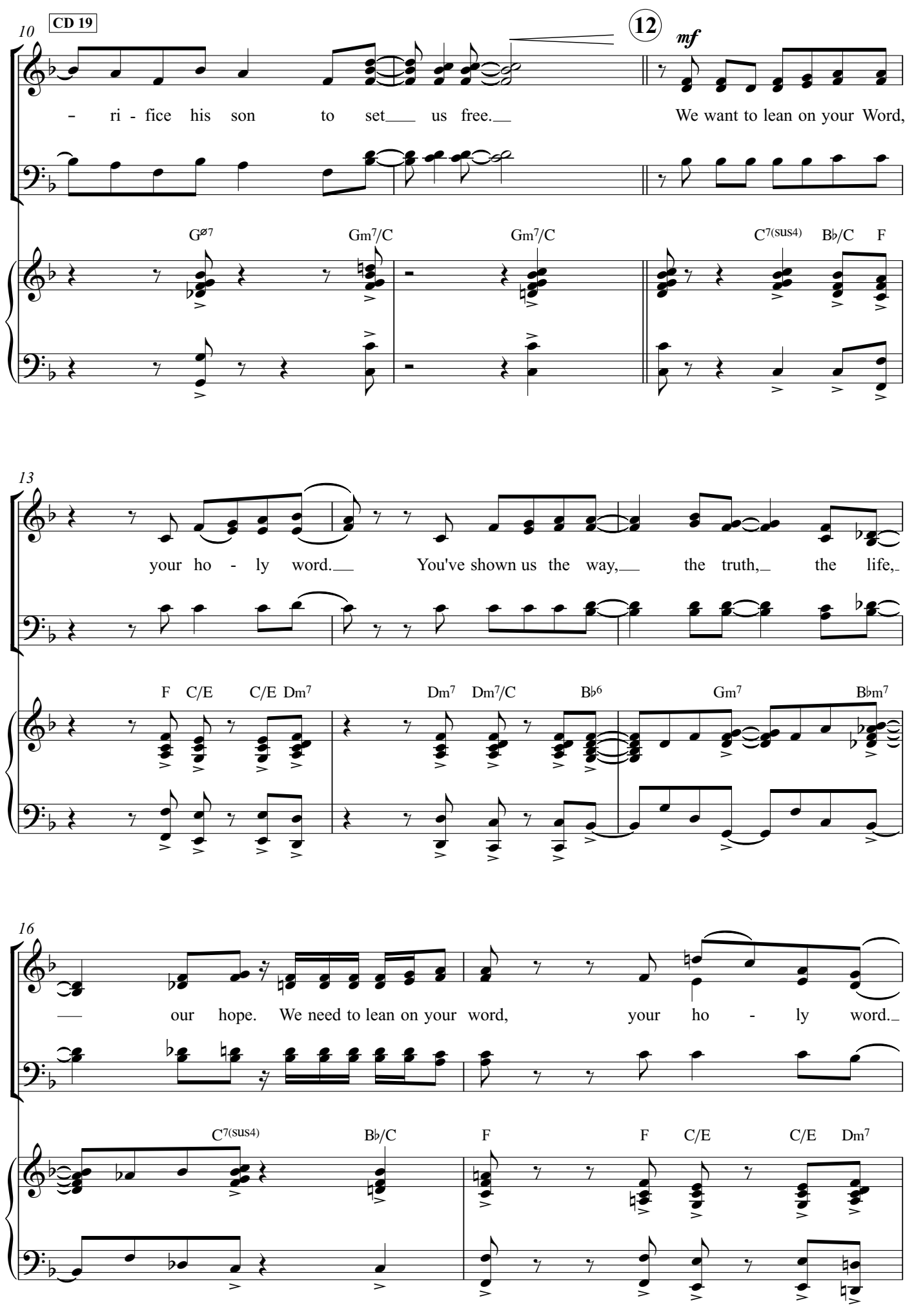
2-Your Word (ANS1303)