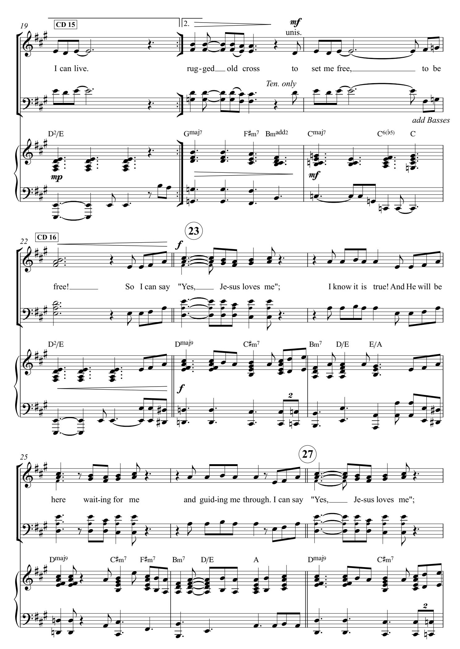
3 — Yes, Jesus Loves Me (ANS1403)