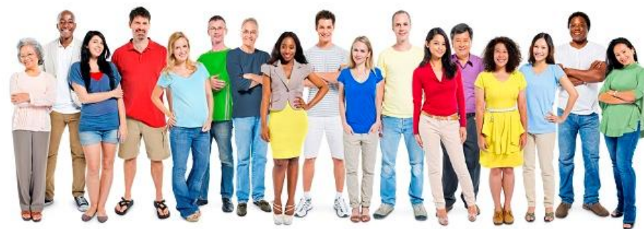
Friends and Family