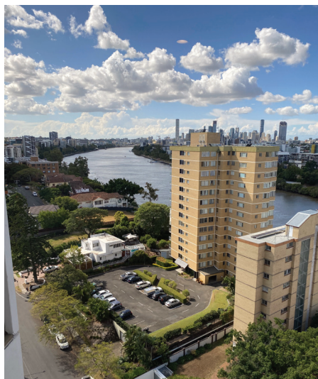
Residents from the Salvos' Pindari hostel in Brisbane were moved to a new location, with this view of the Brisbane River, as part of the Queensland Government's efforts to combat COVID-19.

"This has impacted decisions around occupancy rates, as well as keeping staff updated with current changes, appropriate signage and industrial cleaning. We have also had to identify rooms that, should someone present with symptoms or need to self-isolate, we could ensure their safety and that of other residents.