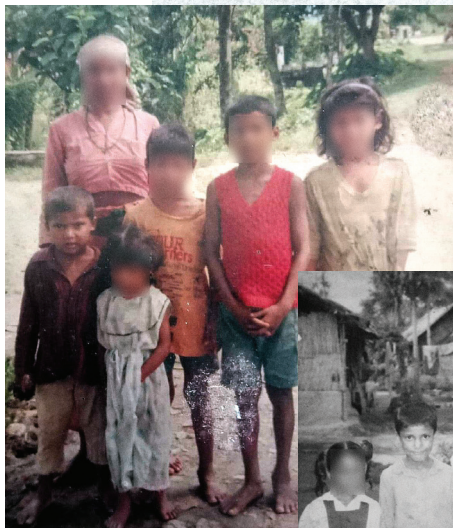
Above and right: With my mother and siblings in Bhutan before we were taken to Nepal.

Eventually my mum took old clothes from others and sewed them into outfits for us and we were so happy and proud to show them off.