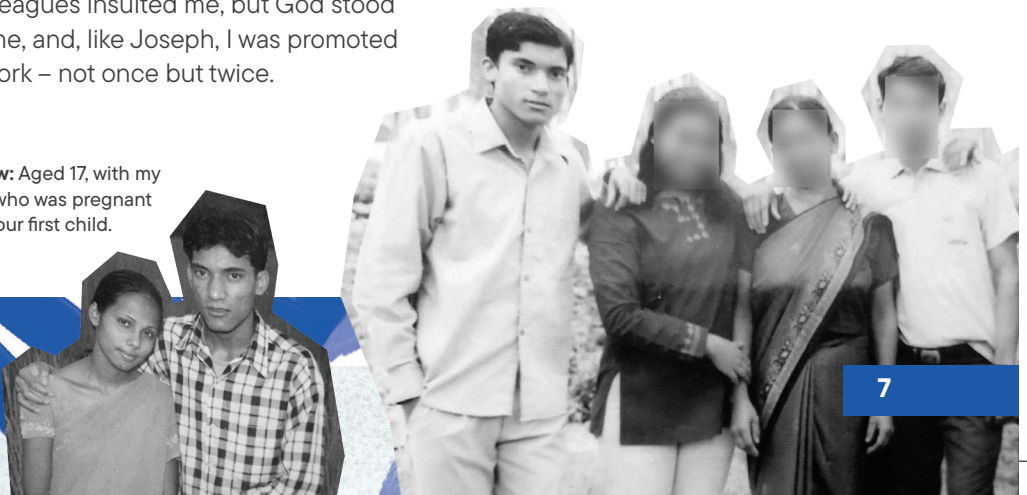
Below: Aged 17, with my wife who was pregnant with our first child.

"He defends the cause of the fatherless and the widow, and loves the foreigner residing among you, giving them food and clothing" (Deuteronomy 10:18, NIV).