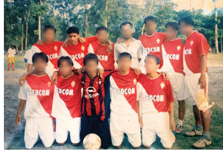
Above: My soccer team in Nepal when I was in college.

In Australia, I faced workplace discrimination due to my English skills. Colleagues insulted me, but God stood by me, and, like Joseph, I was promoted at work – not once but twice.