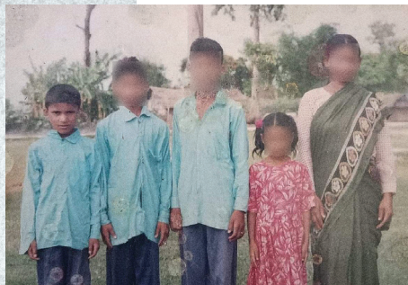
Above: My family was provided with new clothes by the UNHCR once a year.

When our son was born in 2005, we were still living in a refugee camp, but were soon offered the opportunity to come to Australia. It usually takes a long and hard time to do the process, but the grace of God and hand of God was with our family and in a very quick time we were on our way.