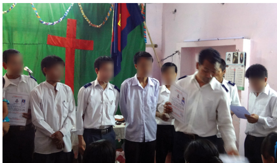
Above: Handing out Salvation Army Soldiership certificates at the Burmese Salvation Army Corps in India.

"How precious to me are your thoughts, God! How vast is the sum of them! Were I to count them, they would outnumber the grains of sand — when I awake, I am still with you" (Psalm 139:17-18, NIV).