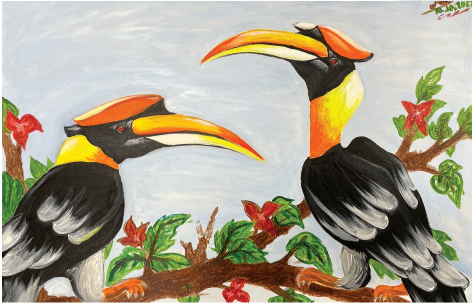
Above: Hornbill painted by my son and daughter in 2023 and gifted to The Salvation Army.

Hornbills are very important to the Chin people and are unique and special birds. They have a two-lobed kidney and are also the only birds in which the first and second neck vertebrae are fused together. This helps to provide a more stable platform for carrying their long bills. They are omnivorous, feeding on fruit and small animals and they nest in natural cavities in trees and sometimes cliffs.