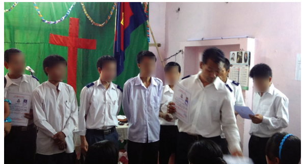
Above: Handing out Salvation Army Soldiership certificates at the Burmese Salvation Army Corps in India.

"How precious to me are your thoughts, God! How vast is the sum of them! Were I to count them, they would outnumber the grains of sand — when I awake, I am still with you" (Psalm 139:17-18, NIV).