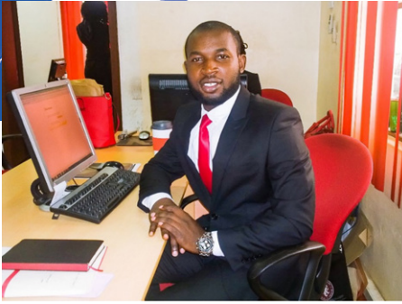
Above: At work in Nigeria, before coming to Australia.