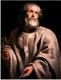
The Apostle Peter