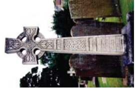
St Peters Church - Cross in graveyard