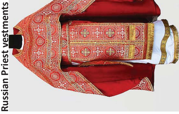
Russian Priest vestments