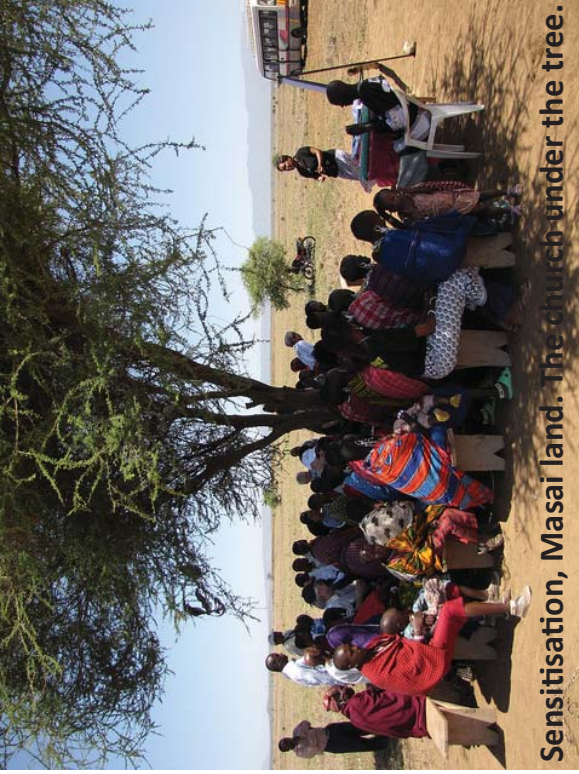
Sensitisation, Masai land. The church under the tree.