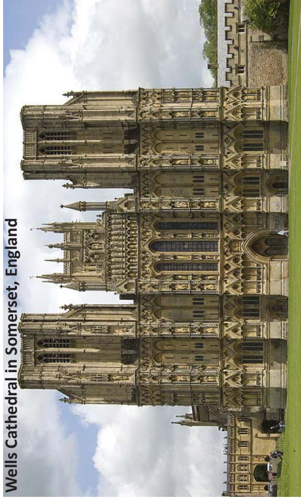
Wells Cathedral in Somerset, England