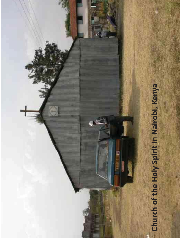
Church of the Holy Spirit in Nairobi, Kenya