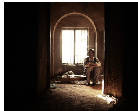
JOSEPH: LIFE OF A SERVANT