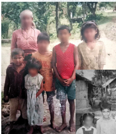
Above and right: With my mother and siblings in Bhutan before we were taken to Nepal.

Eventually my mum took old clothes from others and sewed them into outfits for us and we were so happy and proud to show them off.