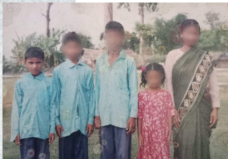
Above: My family was provided with new clothes by the UNHCR once a year.

When our son was born in 2005, we were still living in a refugee camp, but were soon offered the opportunity to come to Australia. It usually takes a long and hard time to do the process, but the grace of God and hand of God was with our family and in a very quick time we were on our way.