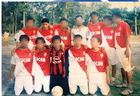
Above: My soccer team in Nepal when I was in college.