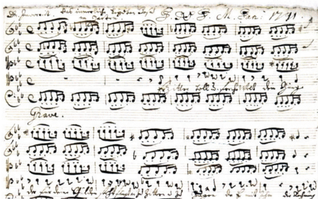
Johann Sebastian Bach manuscript showing the SDG notation